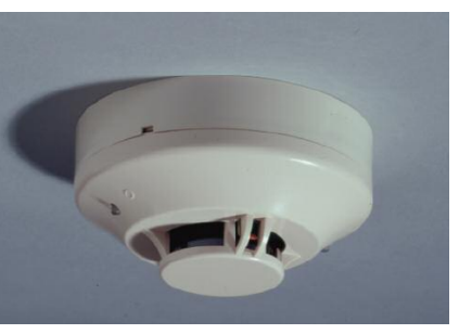
B501 Base Installed with Detector