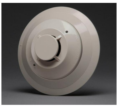
B210LP Base Installed with Detector