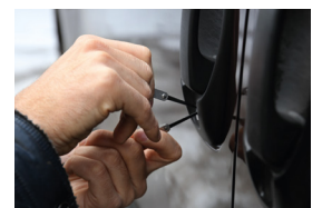
ANTI-THEFT & BACKUP SOLUTION